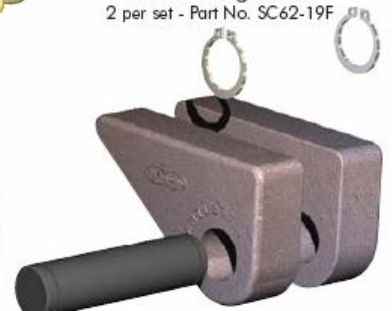
Trailer Configuration 2 per set - Part No. SC62-19F