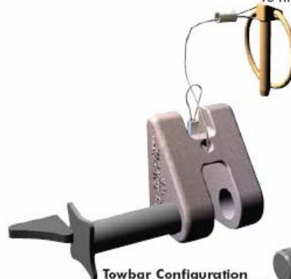
Towbar Configuration 2 per set - Part No. SC62-13R