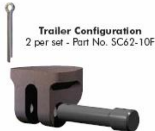
Trailer Configuration 2 per set - Part No. SC62-10F