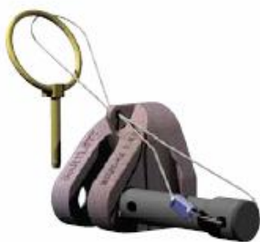
Towbar Configuration 2 per set - Part No. SC62-10R