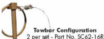
Towbar Configuration 2 per set - Part No. SC62-16R