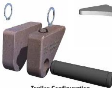
Trailer Configuration 2 per set - Part No. SC62-16F