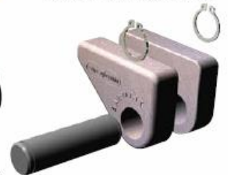
Trailer Configuration 2 per set - Part No. SC62-13F